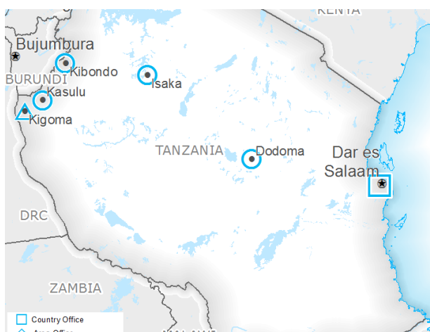
Tanzania: Emergency Food Assistance to Burundian Refugees

Photo: A Burundian refugee receives food during a General Food Distribution at Nyarugusu Refugee Camp.