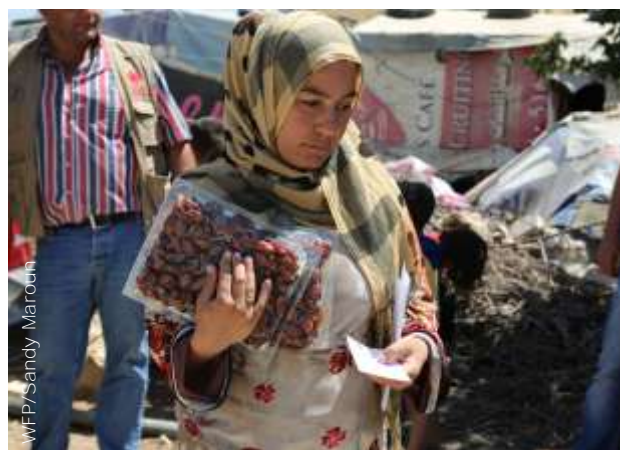
Syrian refugees in Lebanon receive dates from WFP thanks to the in-kind contribution from the Kingdom of Saudi Arabia

2014 saw the distribution of the Kingdom of Saudi Arabia's yearly in-kind contribution of 4000 mt of dates to vulnerable populations affected by the Syria regional crisis in Lebanon and Jordan. The destination of the dates was decided by Saudi Arabia, in light of the urgent needs in the region and the continued hardship faced by the Syrian refugee population. Arriving during Ramadan, the dates were greatly appreciated by the beneficiaries and provided vital food assistance to those people struggling to sustain their basic needs.