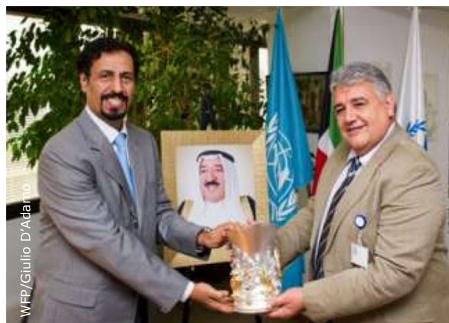
The Deputy Executive Director and the Ambassador of Kuwait celebrate the Amir of Kuwait's Humanitarian Leader Award at WFP HQ in Rome