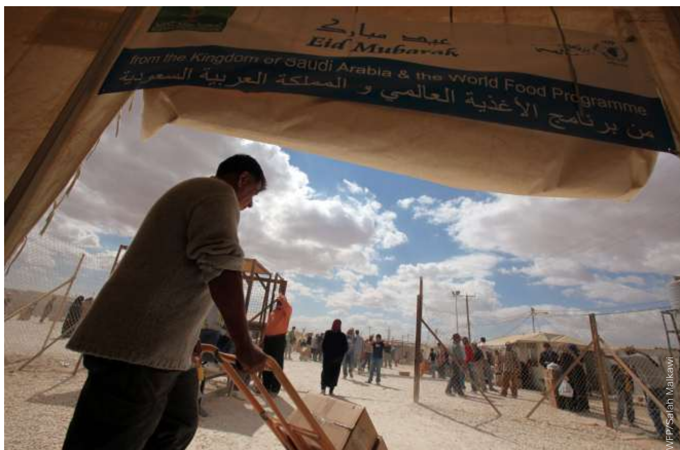
Syrian refugees in Jordan receive food assistance from WFP thanks to the Kingdom of Saudi Arabia