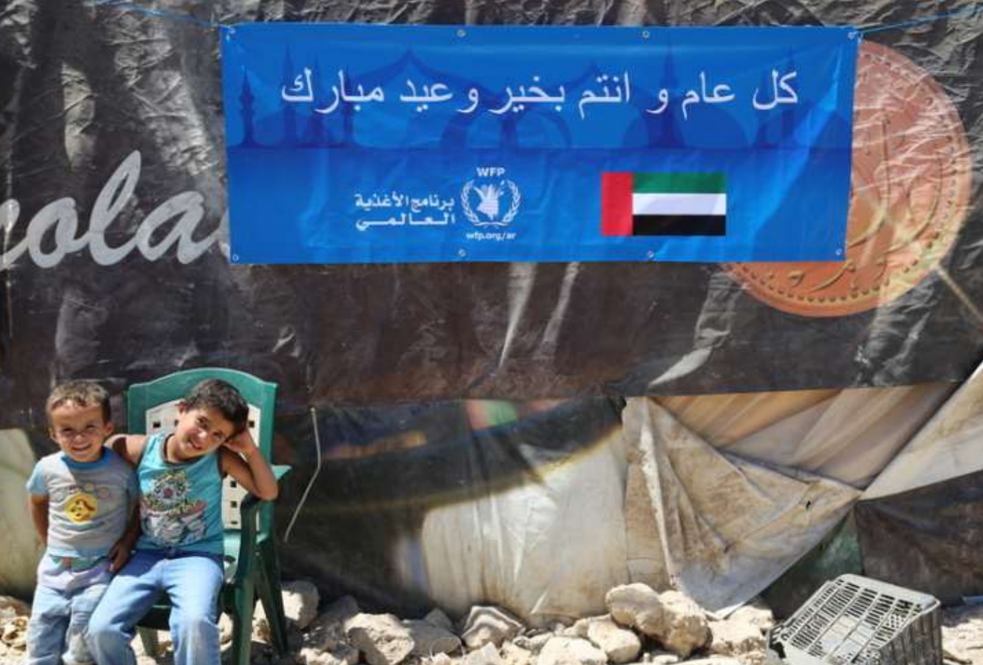
Refugees from Syria receive food assistance from WFP thanks to the contribution from the United Arab Emirates