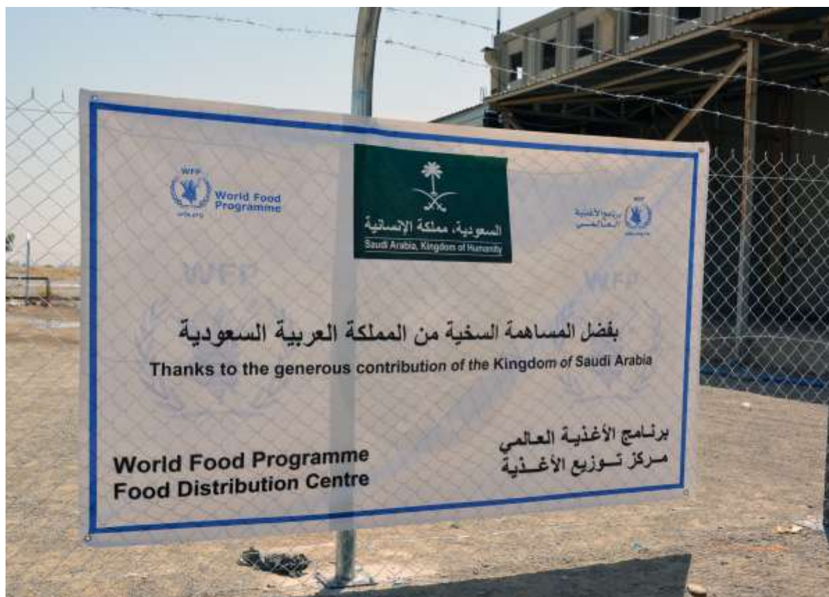
Families in Iraq receive food distributed by WFP thanks to the contribution from the Kingdom of Saudi Arabia

At the end of the year, when humanitarian needs were at one of their greatest peaks, WFP received US$104 million from His Majesty King Abdullah bin Abdulaziz Al-Saud to assist refugees sheltering in Ethiopia, Kenya, and countries neighbouring Syria. The contribution included US$52 million to support about 1.7 million Syrian refugees who were facing suspension of their food assistance for December, just as another harsh winter in the region loomed; US$42 million for refugees sheltering in Ethiopia, many from South Sudan; and US$10 million to provide nutrition to refugees in Kenya. The funds went immediately to help people facing hunger and an uncertain future. WFP was extremely grateful for this assistance, which came at a crucial moment for these refugees—all of whom had fled protracted conflict. The generous gift also solidified the Kingdom of Saudi Arabia's place as one of WFP's major donors.